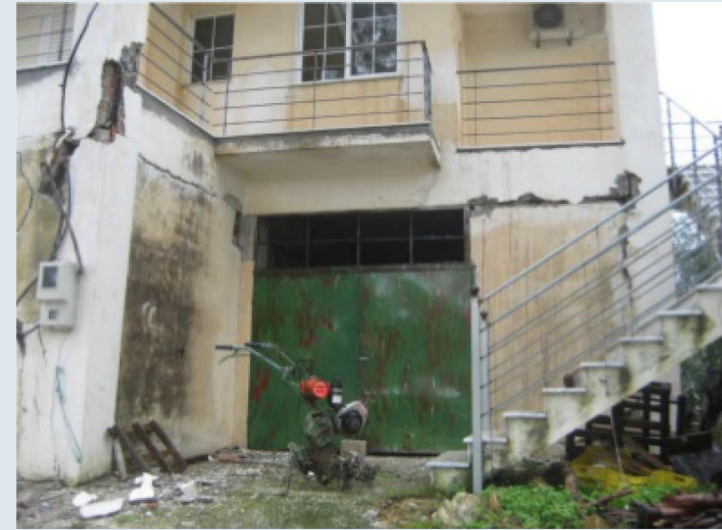
EPPO-ITSAK, 2014. Report on the Mw:6.0 Cephalonia earthquake of 3rd Feb 2014. Earthquake Planning and Protection Organisation-Institute of Engineering Seismology and Earthquake Engineering. http://www.slideshare.net/itsak-eppo/20140203-kefaloniaeq-report-en (downloaded 10/03/14). 6