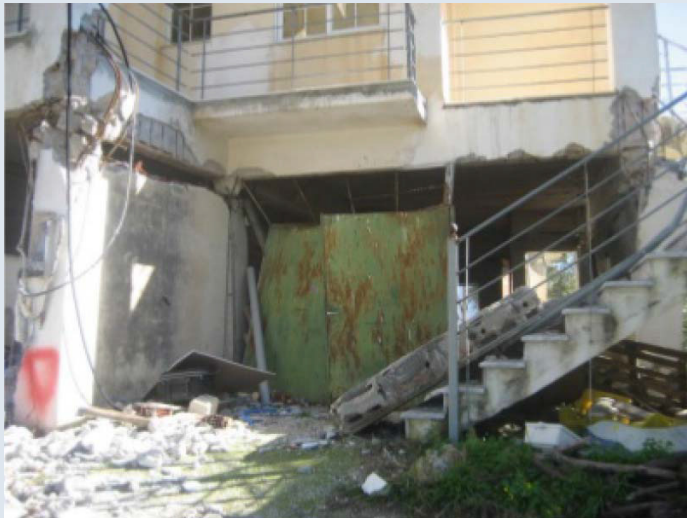
EPPO-ITSAK, 2014. Report on the Mw:6.0 Cephalonia earthquake of 3rd Feb 2014. Earthquake Planning and Protection Organisation-Institute of Engineering Seismology and Earthquake Engineering. http://www.slideshare.net/itsak-eppo/20140203-kefaloniaeq-report-en (downloaded 10/03/14). 7