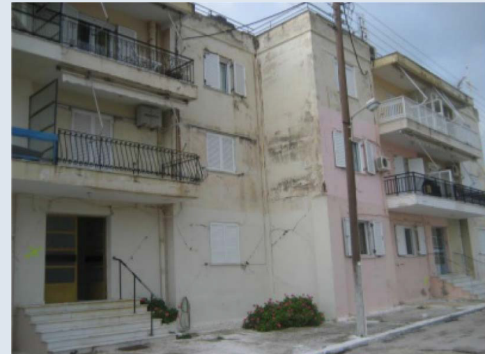
EPPO-ITSAK, 2014. Report on the Mw:6.0 Cephalonia earthquake of 3rd Feb 2014. Earthquake Planning and Protection Organisation-Institute of Engineering Seismology and Earthquake Engineering. http://www.slideshare.net/itsak-eppo/20140203-kefaloniaeq-report-en (downloaded 10/03/14). 8