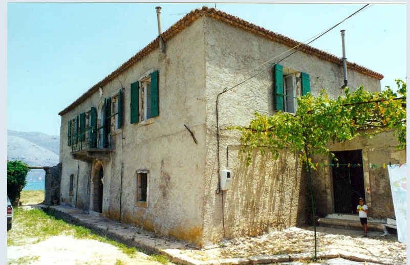
Livieratos, S., 2014. 1 building 300 years and 3 earthquakes. 20th Students Conference "Repair and Strengthening of Structures 2014", University of Patras (in Greek).