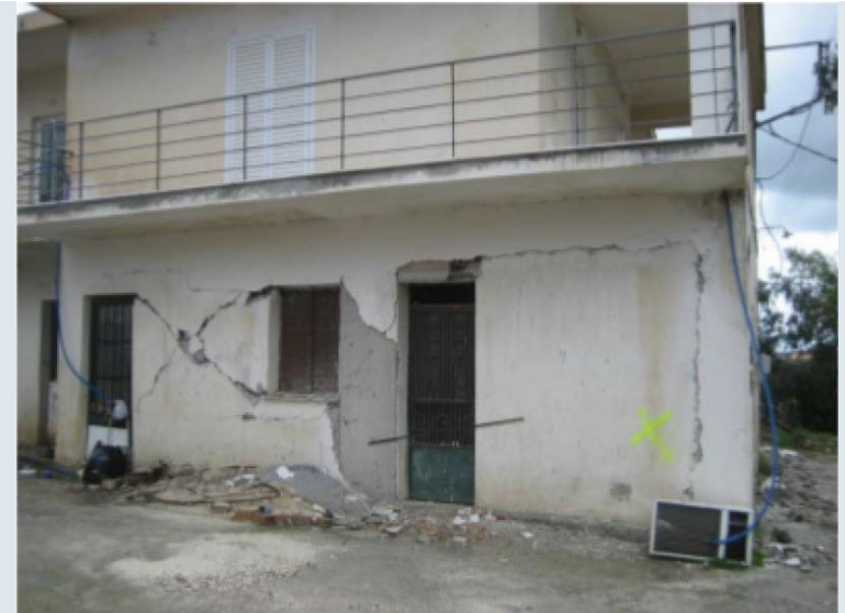
EPPO-ITSAK, 2014. Report on the Mw:6.0 Cephalonia earthquake of 3rd Feb 2014. Earthquake Planning and Protection Organisation-Institute of Engineering Seismology and Earthquake Engineering. http://www.slideshare.net/itsak-eppo/20140203-kefaloniaeq-report-en (downloaded 10/03/14).