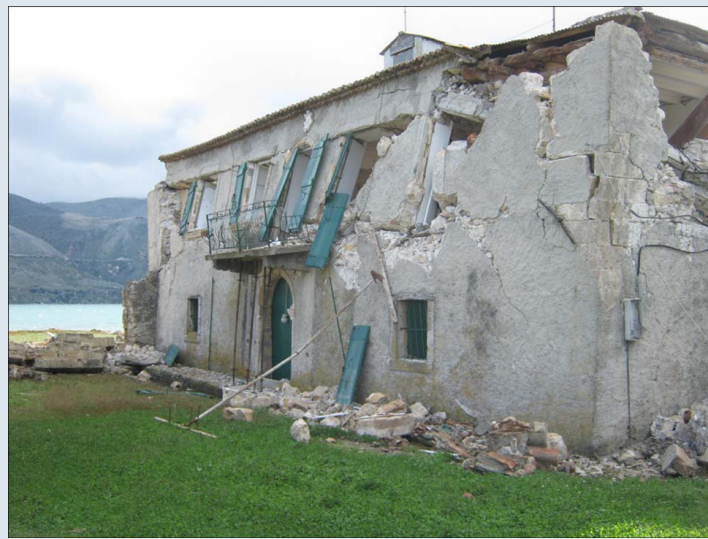
IAS, 2014. Presentation of 2014 Kefalonia earthquakes damage assessment and statistics. Department of Earthquake Recovery, Argostoli, 6th March, 2014