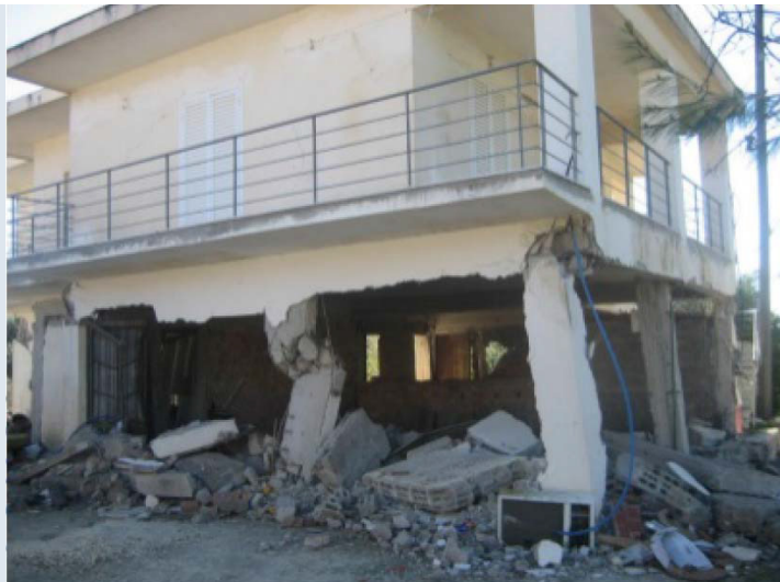
EPPO-ITSAK, 2014. Report on the Mw:6.0 Cephalonia earthquake of 3rd Feb 2014. Earthquake Planning and Protection Organisation-Institute of Engineering Seismology and Earthquake Engineering. http://www.slideshare.net/itsak-eppo/20140203-kefaloniaeq-report-en (downloaded 10/03/14).