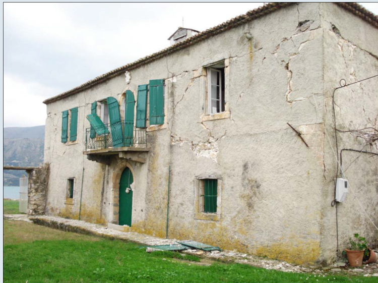
IAS, 2014. Presentation of 2014 Kefalonia earthquakes damage assessment and statistics. Department of Earthquake Recovery, Argostoli, 6th March, 2014