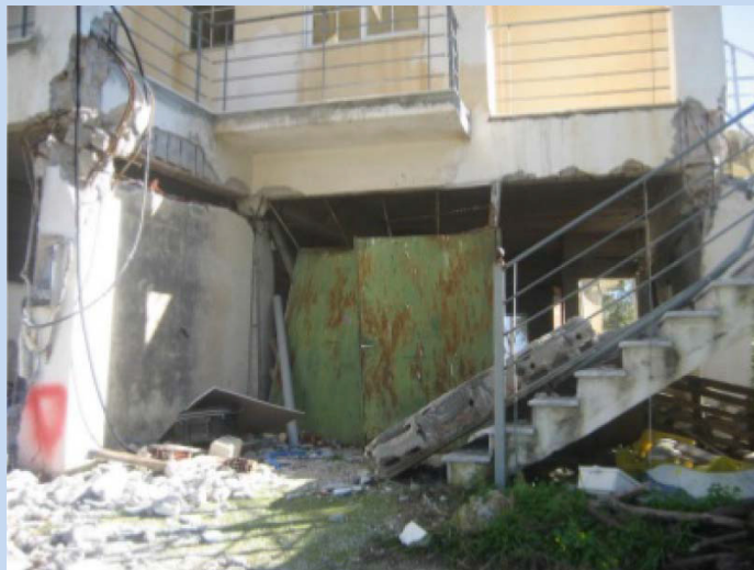
EPPO-ITSAK, 2014. Report on the Mw:6.0 Cephalonia earthquake of 3rd Feb 2014. Earthquake Planning and Protection Organisation-Institute of Engineering Seismology and Earthquake Engineering. http://www.slideshare.net/itsak-eppo/20140203-kefaloniaeq-report-en (downloaded 10/03/14).