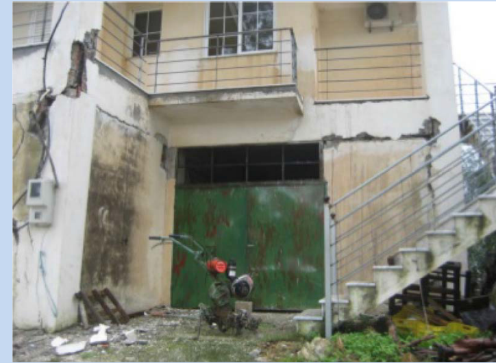
EPPO-ITSAK, 2014. Report on the Mw:6.0 Cephalonia earthquake of 3rd Feb 2014. Earthquake Planning and Protection Organisation-Institute of Engineering Seismology and Earthquake Engineering. http://www.slideshare.net/itsak-eppo/20140203-kefaloniaeq-report-en (downloaded 10/03/14).