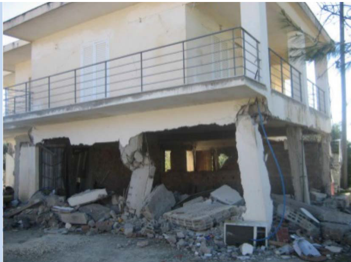
EPPO-ITSAK, 2014. Report on the Mw:6.0 Cephalonia earthquake of 3rd Feb 2014. Earthquake Planning and Protection Organisation-Institute of Engineering Seismology and Earthquake Engineering. http://www.slideshare.net/itsak-epo/20140203-kefaloniaeq-report-en (downloaded 10/03/14).