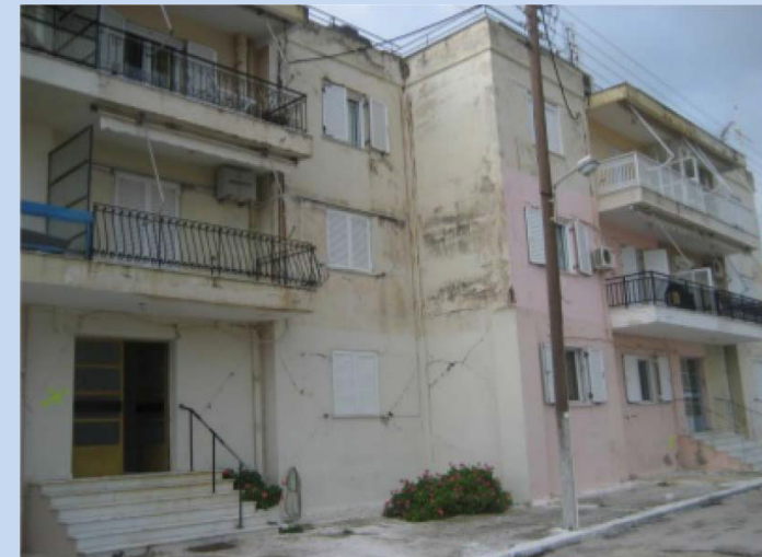
EPPO-ITSAK, 2014. Report on the Mw:6.0 Cephalonia earthquake of 3rd Feb 2014. Earthquake Planning and Protection Organisation-Institute of Engineering Seismology and Earthquake Engineering. http://www.slideshare.net/itsak-eppo/20140203-kefaloniaeq-report-en (downloaded 10/03/14).