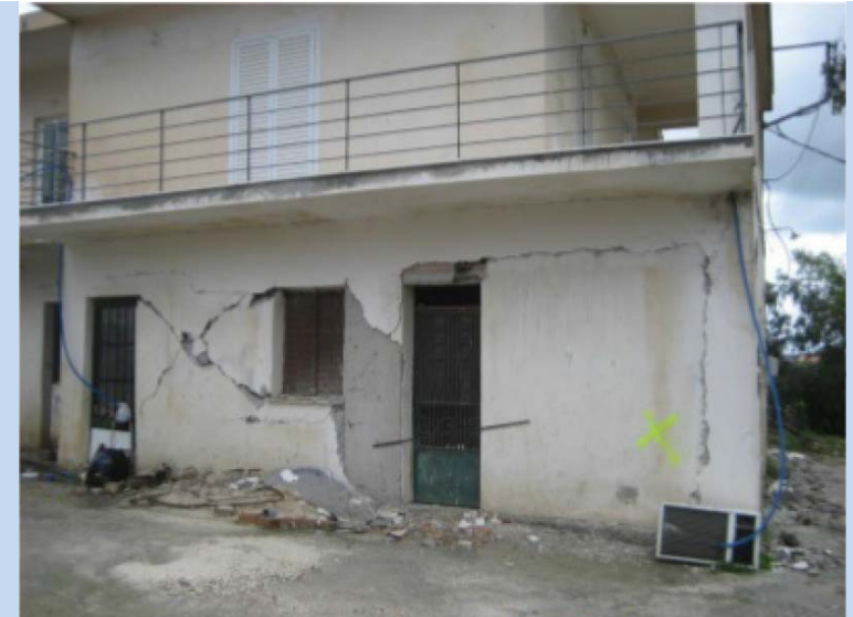
EPPO-ITSAK, 2014. Report on the Mw:6.0 Cephalonia earthquake of 3rd Feb 2014. Earthquake Planning and Protection Organisation-Institute of Engineering Seismology and Earthquake Engineering. http://www.slideshare.net/itsak-epo/20140203-kefaloniaeq-report-en (downloaded 10/03/14).